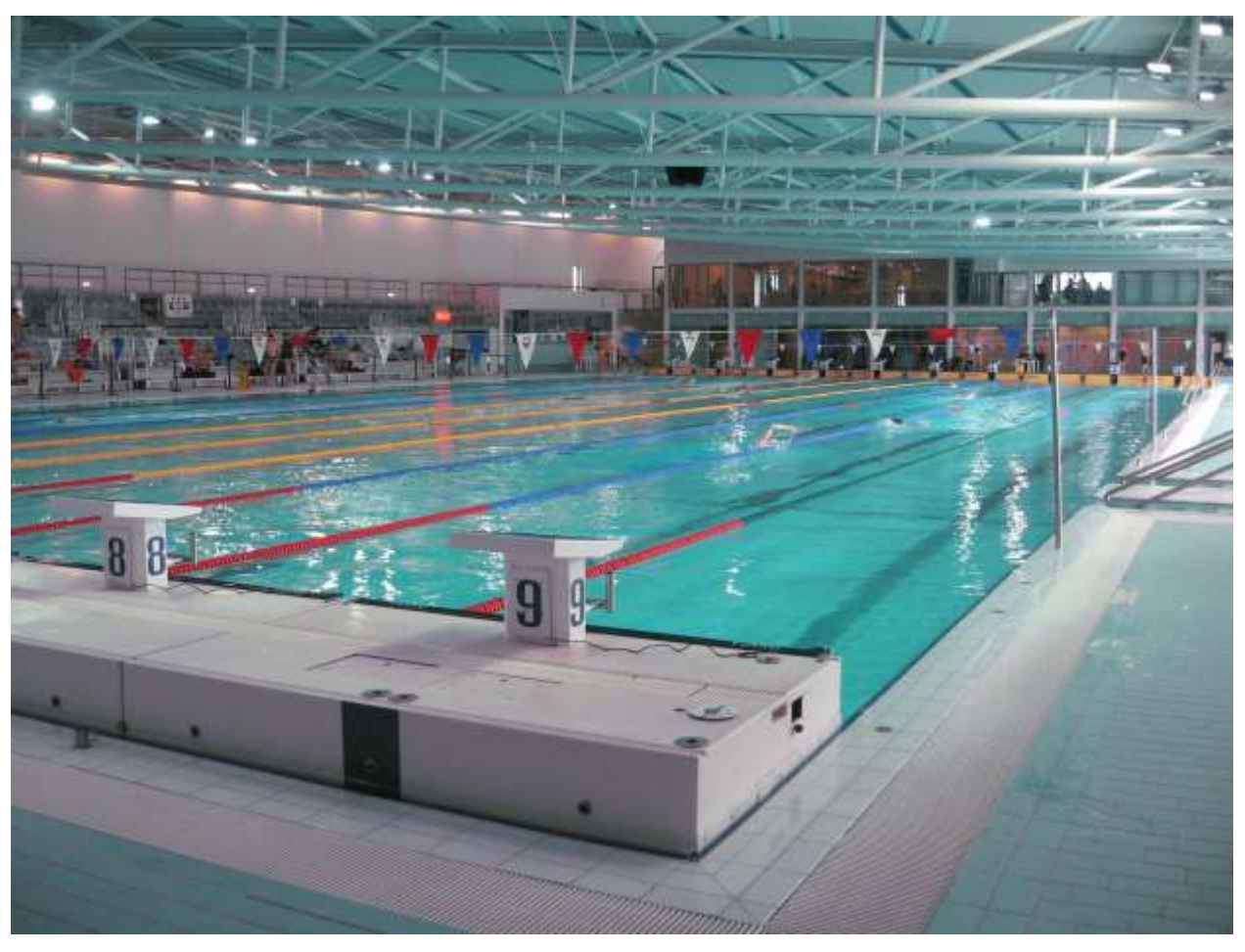
The Laugardal indoor Swimming pool - 50m, 10 lanes