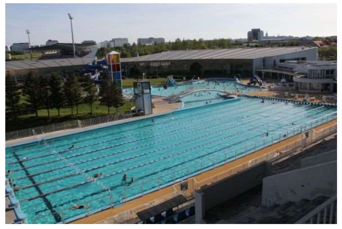
The Laugardal geothermal outdoor swimming pool – 50m, 8 lanes